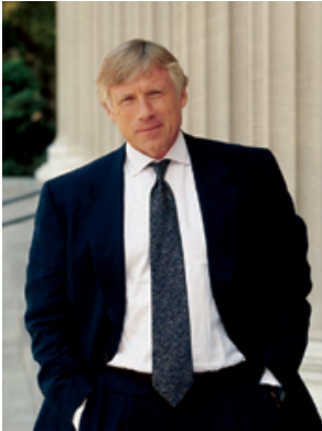
Lee C. Bollinger